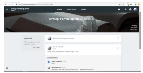
Figure 1 google classroom learning media

The benefits of using google classroom learning media, among others: